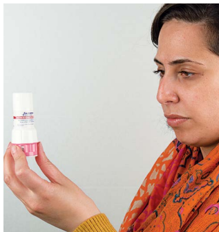
1. Hold upright