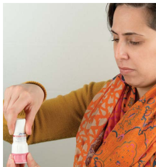
2. Twist cap off