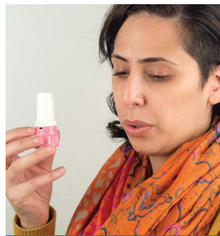
3. Breathe out