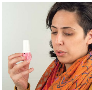
6. Breathe out