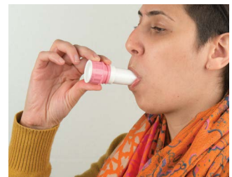
4. Tilt chin slightly, seals lips around mouthpiece, and breathe in fast and deep