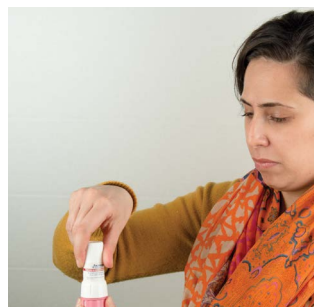
7. Replace the cap tightly