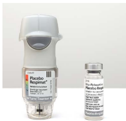
1. Two pieces - inhaler & cartridge