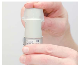
9. Close cap