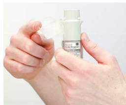
3. Open cap