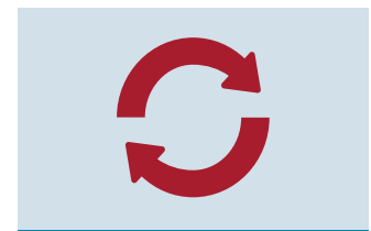
4. Repeat steps 1-3 until you see a mist, then repeat 3 more times 5. Close Cap.