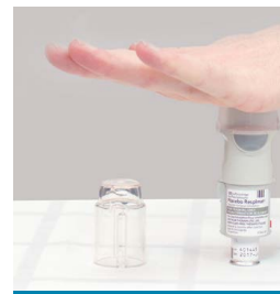
4. Push firmly down on the inhaler until you hear a click