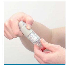
5. Put clear base back into place