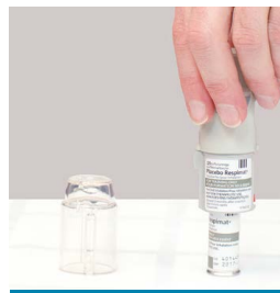
3. Push cartridge into inhaler