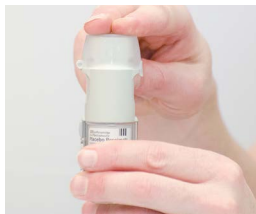
1. Hold upright

Note: The acronym TOP – Turn, Open, Press is a quick reference for device instruction.