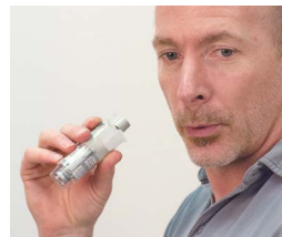
4. Breathe out