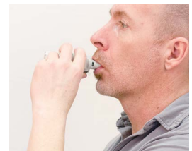
5. Seal lips around mouthpiece