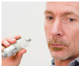
7. Hold breath 5-10 secs