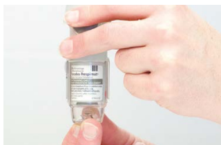
1. Hold upright. TURN base until it clicks

NOTE: If the device is not used for 7 or more days, prime once. If it is not used for 21 or more days, repeat the full priming process.