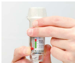
2. TURN base until it clicks