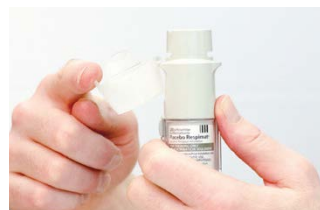
2. OPEN cap until it snaps fully open