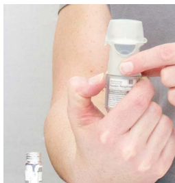
2. Remove clear base