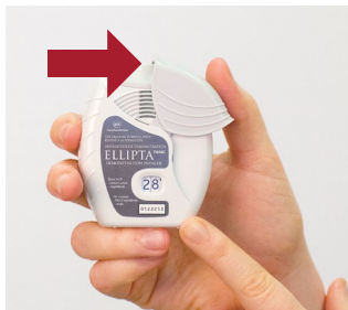
1. Slide the cover over