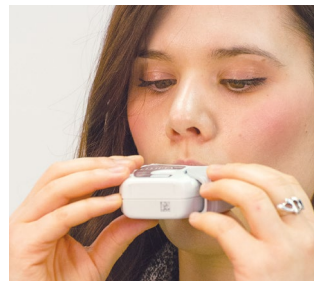
3. Seal lips around mouthpiece and tilt chin.