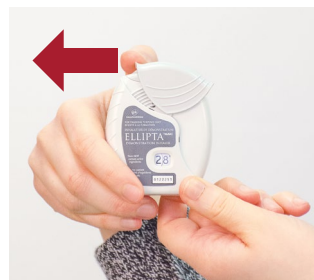
7. Slide the cover to close