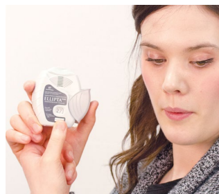
6. Breathe out