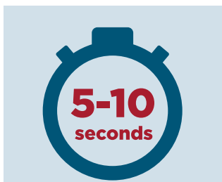
5. Hold breath (5-10 secs)