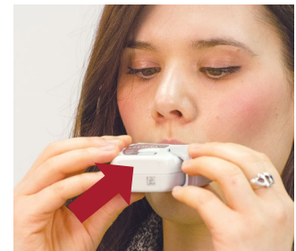
4. Breathe in a long, steady and deep