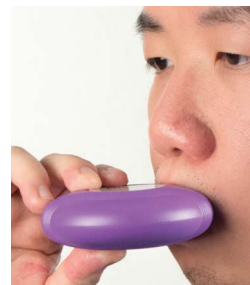
4. Seal lips around the mouthpiece and tilt chin up