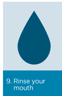
9. Rinse your mouth