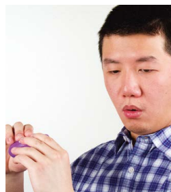
7. Breathe out