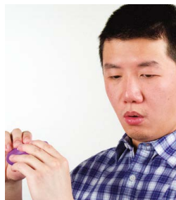
3. Breathe out