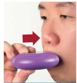
5. Breathe in steadily and deeply