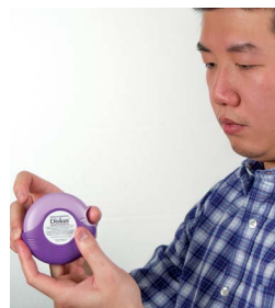
8. Slide the thumb grip to close