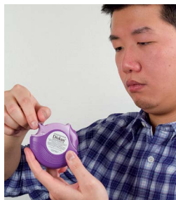
2. Slide lever until a click is heard