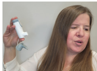
3. Breathe out