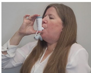
5. Breathe in slowly and deeply while spraying 1 puff