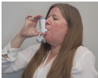
5. Breathe in slowly and deeply while spraying 1 puff