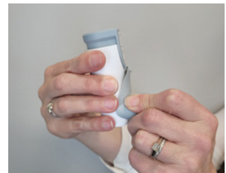
9. Put the cap back on 10. Rinse your mouth