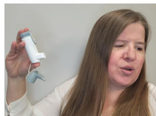
3. Breathe out