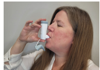
4. Seal lips around the mouthpiece and tilt chin up