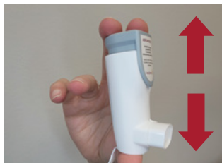
2. Shake the inhaler