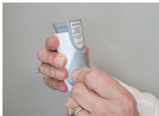
1. Remove the cap