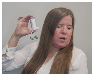
6. Hold your breath (5-10 secs) 7. Breathe out