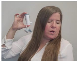
6. Hold your breath (5-10 secs) 7. Breathe out